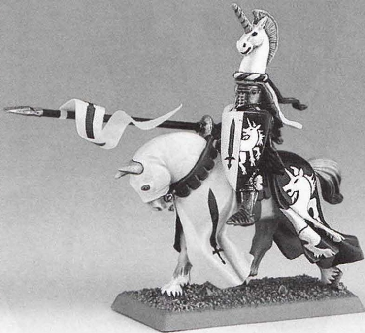
Chivalrous Questing Knight