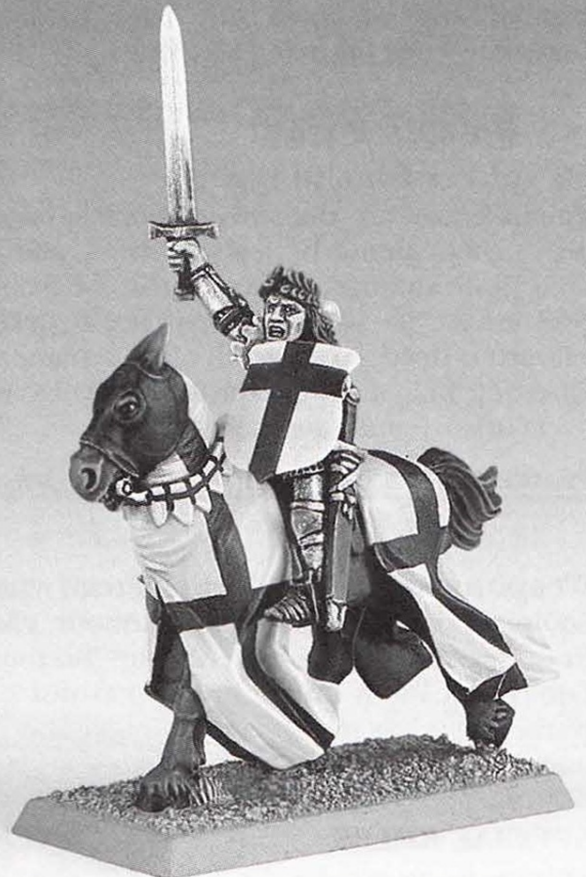
Impetuous Knight Errant